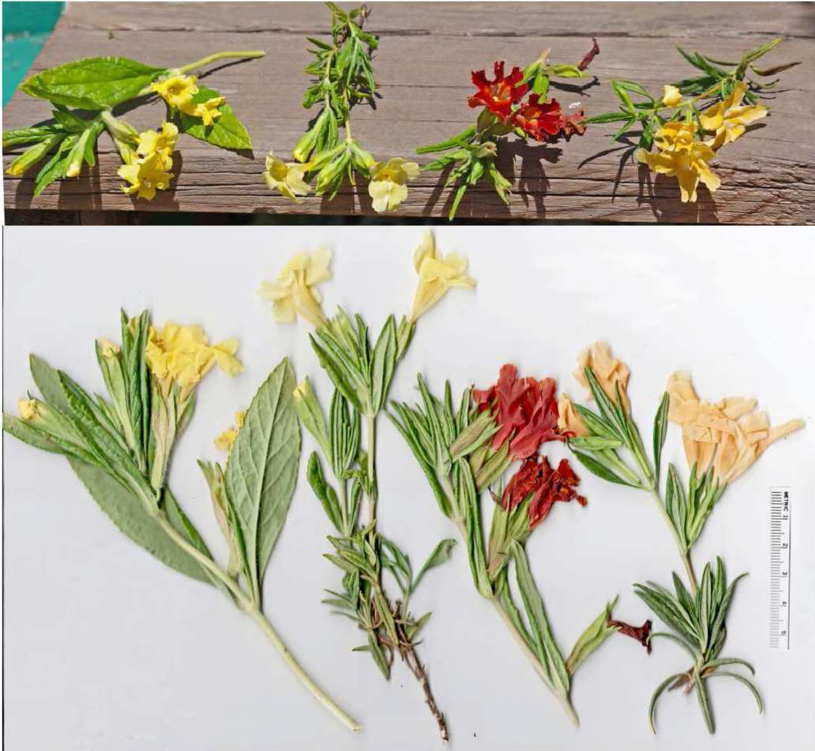
Figure 2. Shrubby Diplacus in cultivation at Las Pilitas Nursery, left to right: D. calycinus , D. longiflorus from the nursery area at Escondido (San Diego Co.), D. rutilus , D. longiflorus from east Thousand Oaks (Ventura Co., near Los Angeles Co.).

Those collections I have studied apparently cannot be separated in any feature except corolla color from typical Diplacus longiflorus , and they might reasonably be considered infrapopulational variants of D. longiflorus . Red corollas have not been observed in the species outside of Los Angeles County (and perhaps Riverside County) and perhaps can be interpreted as reflecting local introgression in this area from D. puniceus . On the other hand, the distinctive linear geographical distribution (see below) of these red-flowered plants and their apparent absence elsewhere in the area where D. x australis occurs suggest that the origin of D. rutilus is different from that of the highly variable D. x australis .